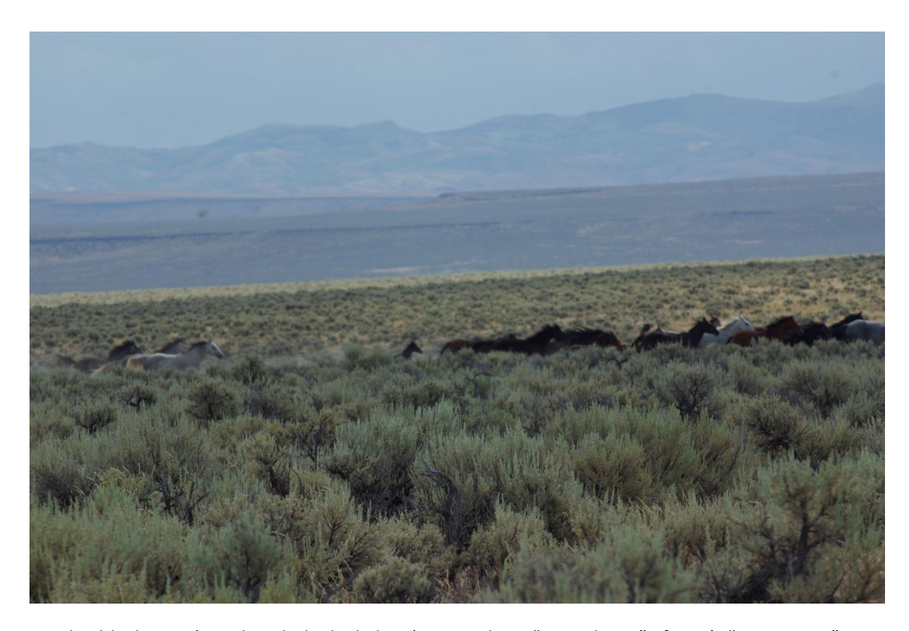
Very healthy horses (note how little the baby is) at just about "ground zero" of BLM's "emergency."