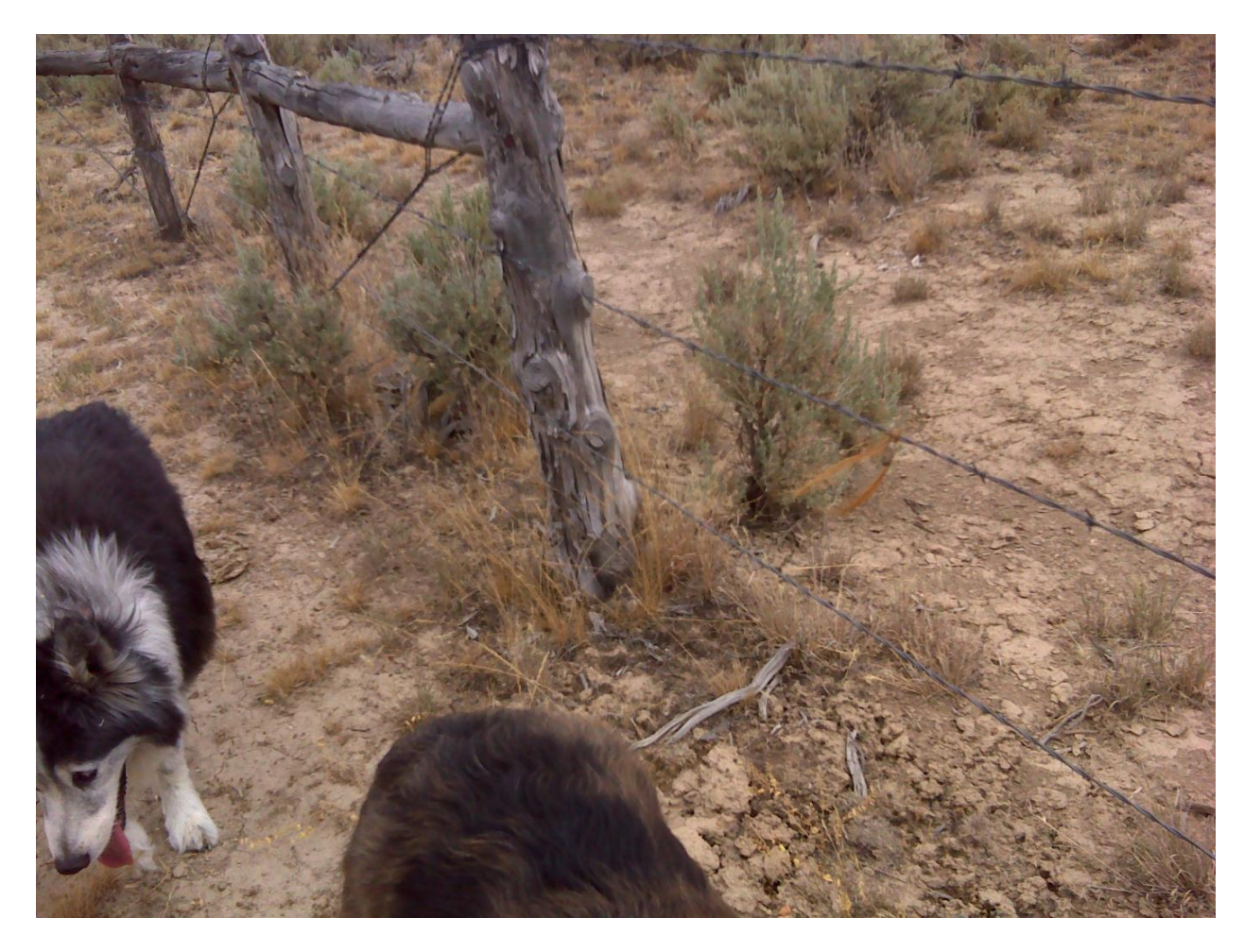
This last shot is the fence at Dry Creek, note horsehair in the fence. It appears Dry Creek has only one access point to Desert Ranch reservoir at this time.